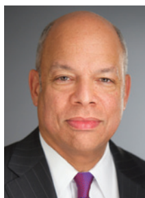
Former U.S. Secretary for the Department of Homeland Security Jeh Johnson.

business, your workforce and your customers. The people who work for you and who depend upon your advice are relying on your leadership to respond in ways that protect them, and that will ensure the resilience of your business.